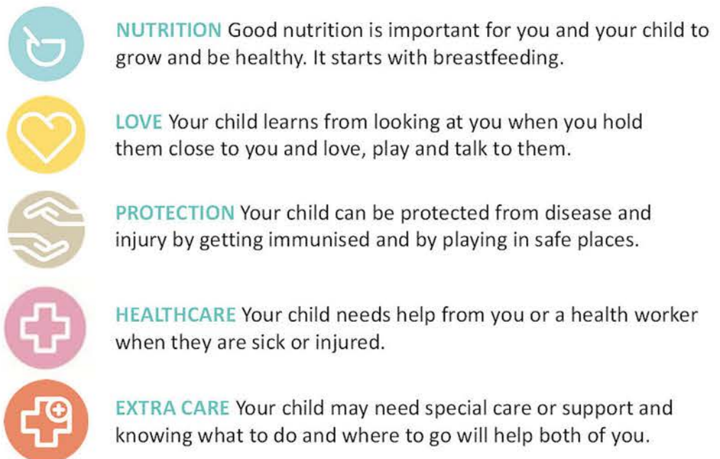
Figure 1. The Road to Health booklet’s five themes: what children need to grow and develop

These pillars address the needs of children (as opposed to the services delivered by the health system) and are intended to cover all aspects of early childhood growth,