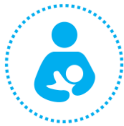
REMUNERATED BREASTFEEDING BREAKS