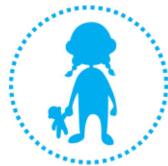
AFFORDABLE, ACCESSIBLE, QUALITY CHILDCARE