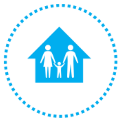
PAID PARENTAL LEAVE

Governments and businesses need to create and TRACK enabling environments for parents to give their children the best start in life, while boosting productivity and women's empowerment.